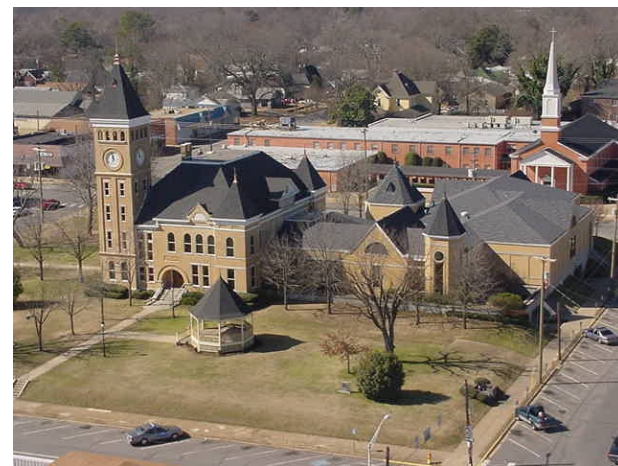
Saline County Courthouse, Benton, Arkansas