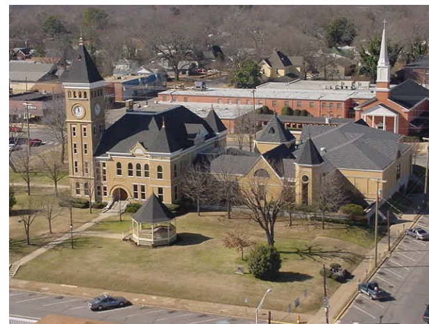
Saline County Courthouse, Benton, Arkansas