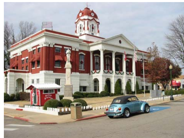
White County Courthouse, Searcy, Arkansas